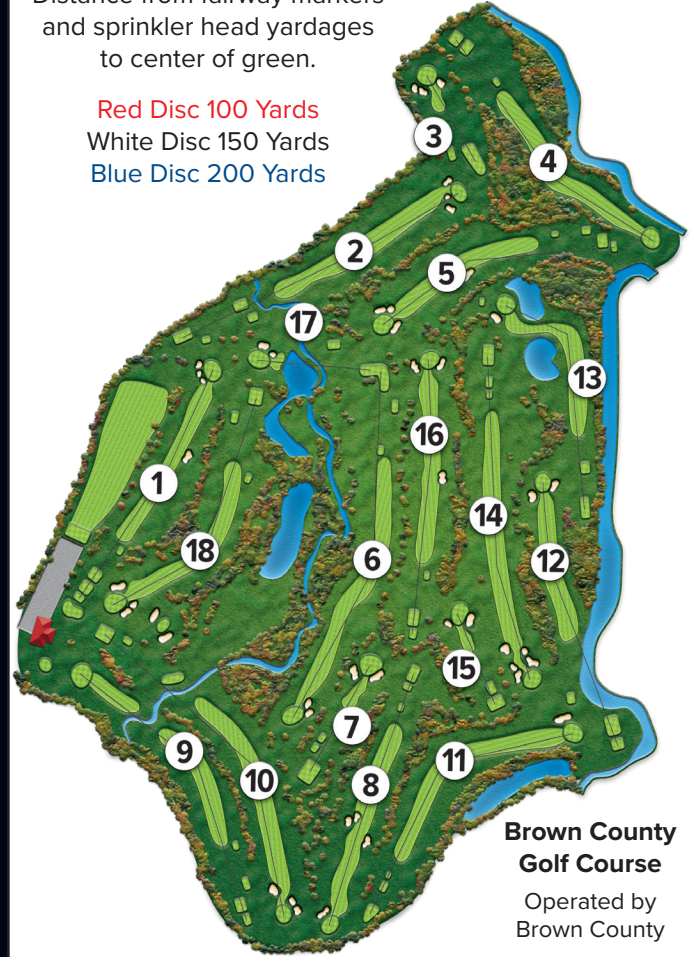
Brown County Golf Course Operated by Brown County

Red Disc 100 Yards White Disc 150 Yards Blue Disc 200 Yards